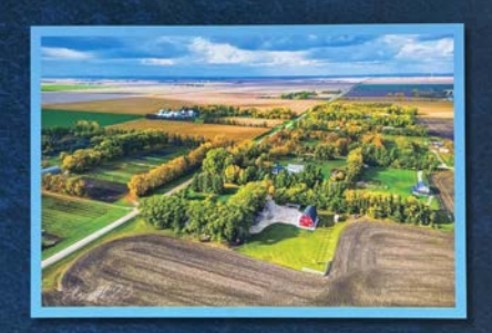
A Mennonite settlement in Manitoba, west of the Red River